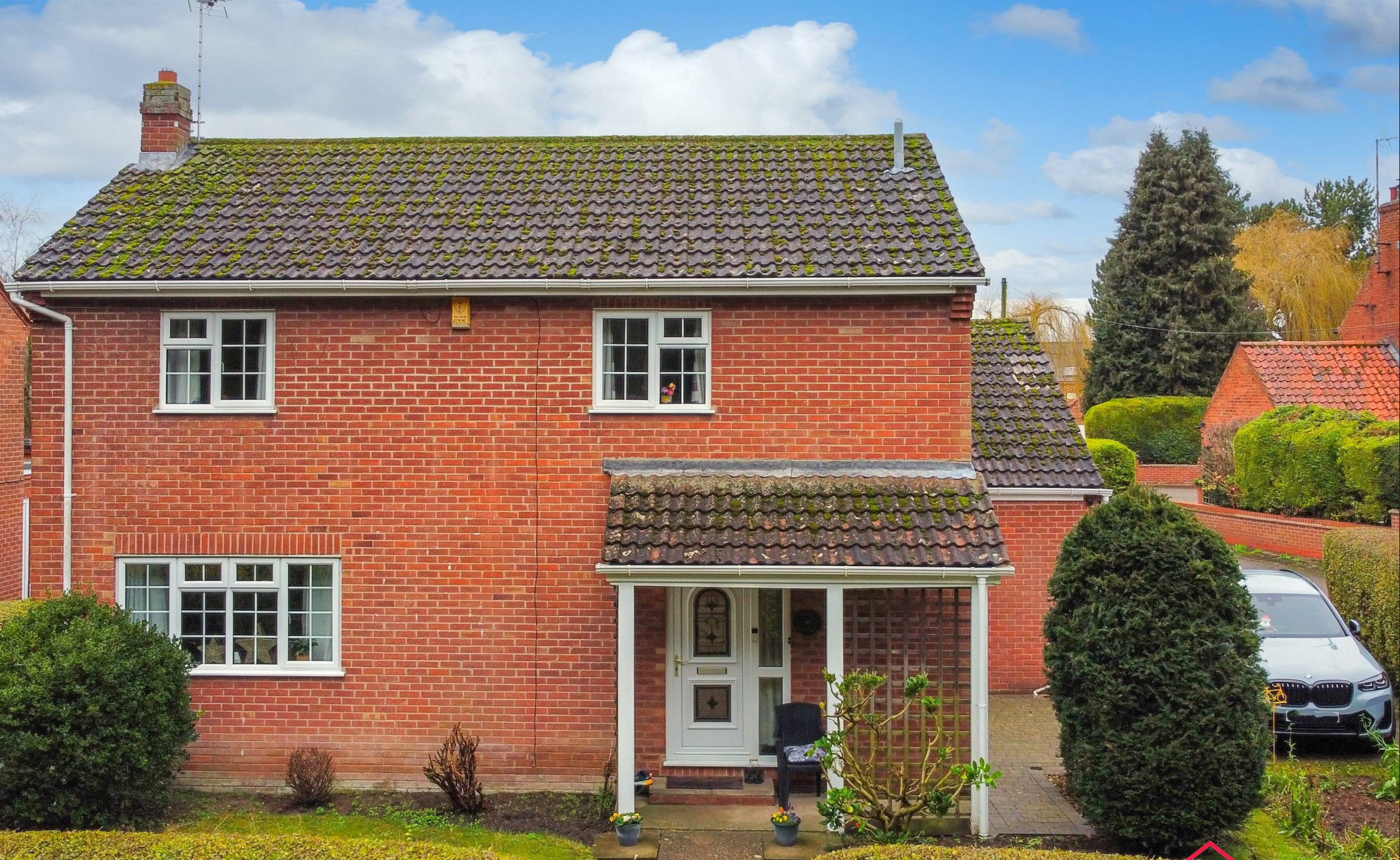
Tare Cottage, Main Street, Caunton, Newark